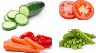
fresh or frozen vegetables