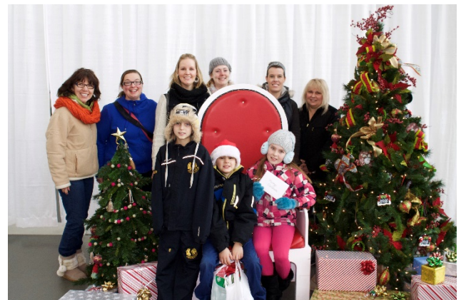
Three students, their parents and teachers represented our Grade 5 classes as they created Christmas hampers